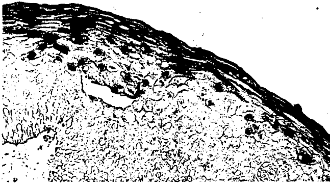
Fig. 2. In situ hybridization with biotinylated DNA probe against human papillomavirus (HPV) type 6. HPV type 6 viral particles are present within several nuclei of the tumor. HPV type 11 revealed similar results (not shown)

sure and along most of the right vocal cord (Fig. 1). Four smaller, discrete, smooth papillomas were situated along the cranial and medial surfaces of the left cord. Flexible bronchoscopy revealed no further papillomas in the respiratory tract. Additional clinical examination as well as routine blood tests were normal.